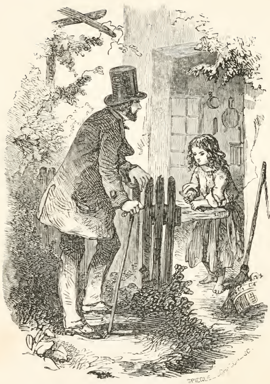
“There stood a little girl, sunburnt and dirty.”—Page 197.